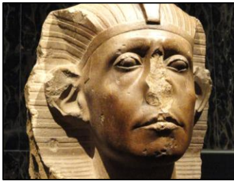
Old Senusret III, c. 1840 BC