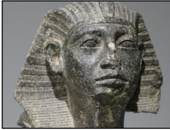
Young Senusret III, c. 1878 BC

At this precise point in history, given by the timespans of Genesis, 5 secular historians say little Sen established direct rule, and, without any resistance, broke the power the nomarchs held for over 1200 years (predating the first dynasty, about 3100 BC ).