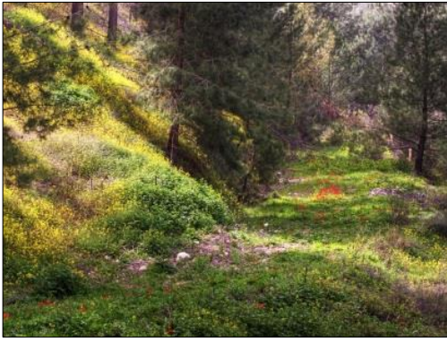
A wooded trail in Galilee

The conquering power in Jesus' ongoing challenge to embrace the intention of the Law commanded awe and eclipsed the religious wimps who demanded dutiful bondage to the letter of the Law.